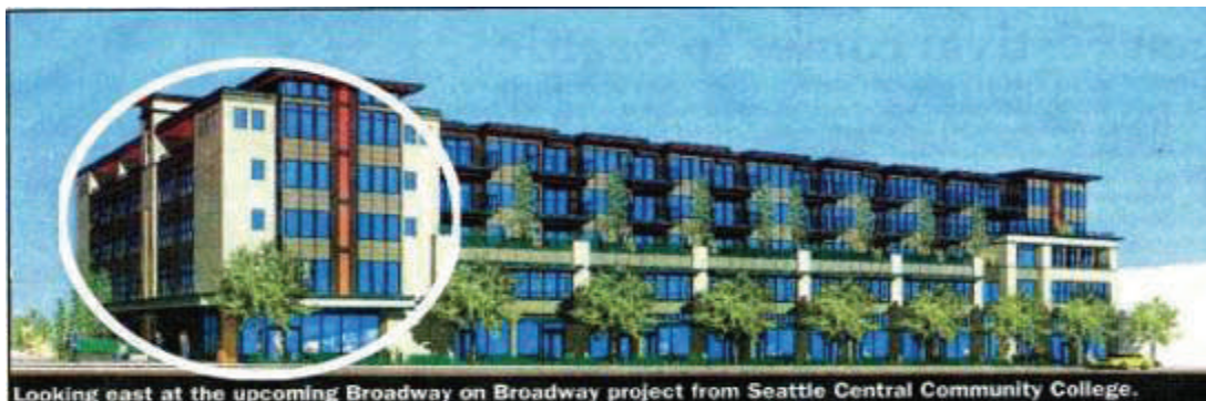
Looking east at the upcoming Broadway on Broadway project from Seattle Central Community College.

Fall '08: just a big hole in the ground.... Winter '09: 1st floor nearly completed; 4 to go!