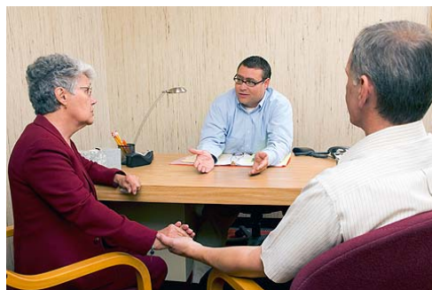
Social & Human Services