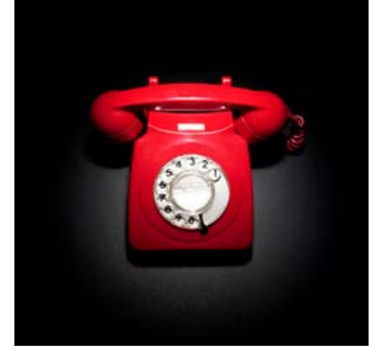
Chemical Dependency Specialist