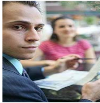
Business Information Technology