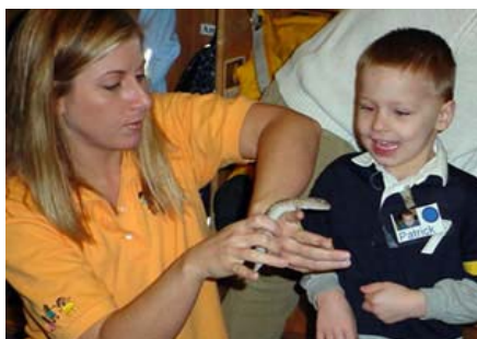
Child and Family Studies