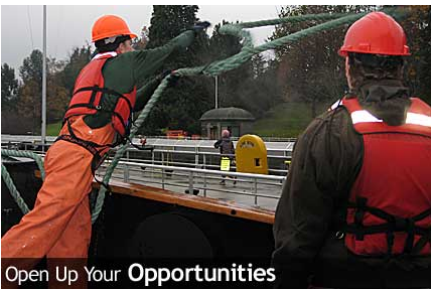
Open Up Your Opportunities